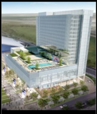
panels property that is scheduled to open this July in Frisco,