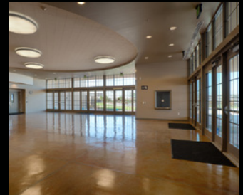
The open entry area in Mountain House High School's gymnasium lobby continues curvilinear ceiling, lighting and other touches designed into campus facilities.