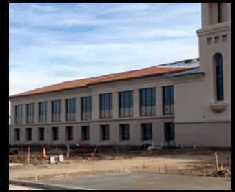
A must-open deadline kept Tarlton & Son workers hustling from March, 2013 until completed.

A leading manufacturer of wallboard in the U.S. since 1972, PABCO® Gypsum is a division of PABCO® Building Products LLC, one of several subsidiaries that make up the Pacific Coast Building Products family of companies, serving customers coast-to-coast. PABCO® Gypsum's complete range of products incorporates numerous proprietary and/or patented fire, water, and mold resistant technologies. Since 2013, QuietRock®, the first and most technically advanced sound reducing drywall and accessories, is also part of the PABCO® family. PABCO® Gypsum plants in Newark, CA and Las Vegas, NV have combined capability to manufacture over 1.65 billion square feet of board annually. For more information, visit www.PABCOgypsum.com .