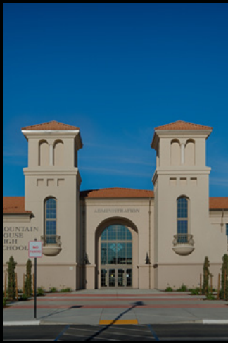
Just opened and now teeming with 400-450 underclassmen, the two-story classroom and administration building anchors the first-ever secondary school campus of the Lammersville, CA, Unified School District in Mountain House, CA.