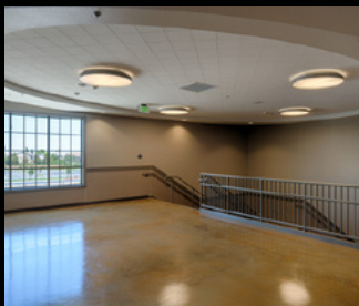
Curvilinear soffits add dynamic dimension and visual flow when traversing Mountain House High School hallways.