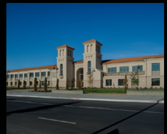
The new Mountain House High School symbolizes forward-thinking spirit and used PABCO Gypsum drywall products.